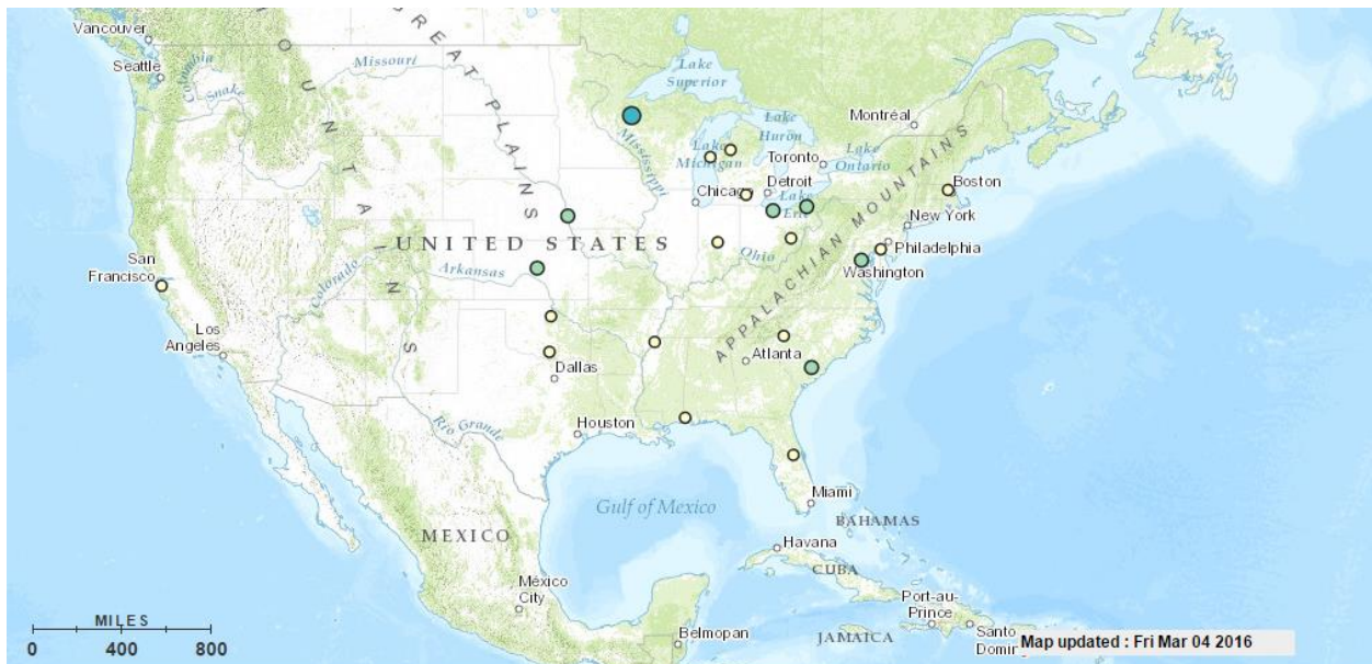
Figure 2. Distribution of Cipangopaludina japonica in the United States. Map from Kipp et al. (2016).