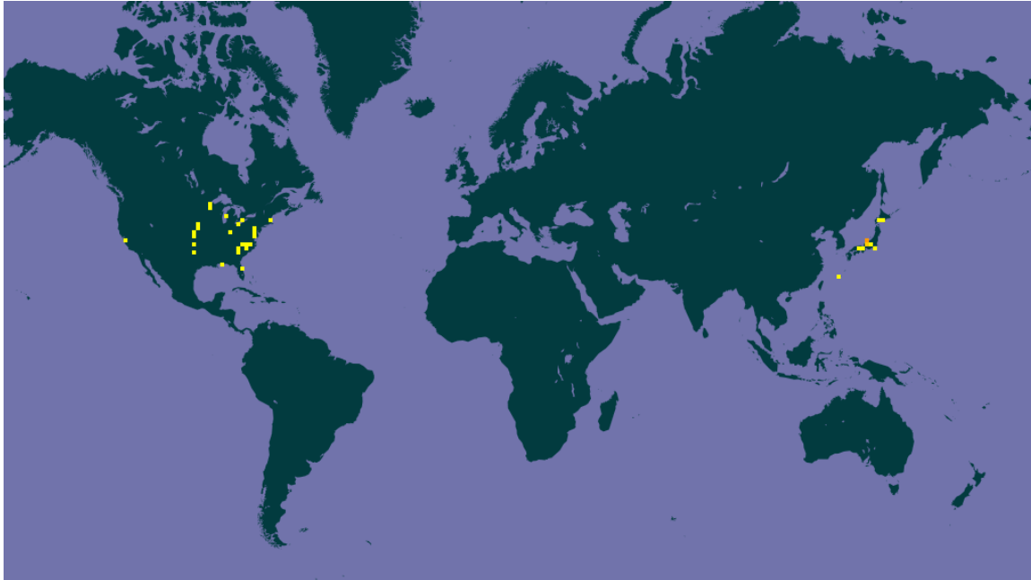
Figure 1. Known global distribution of Cipangopaludina japonica . Map from GBIF Secretariat (2016).